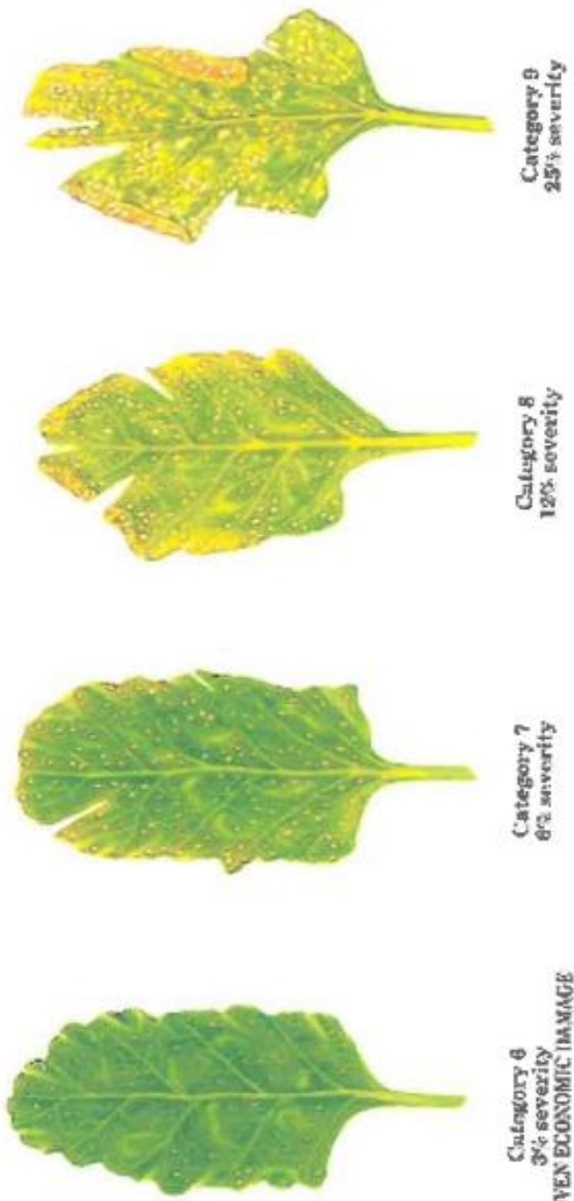
Figure B: Cercospora Leaf Spot Damage Categories